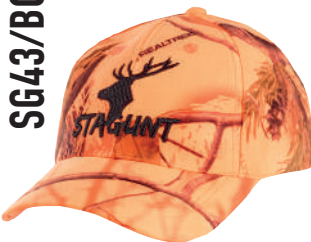
CAMO CAP SG43/BC