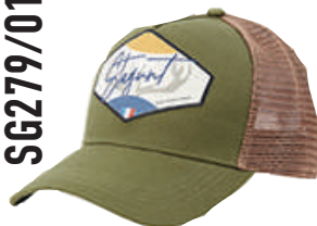
ANTLER CAP SG279/010