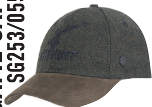
SP GAME CAP SG253/055