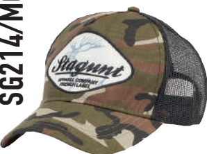
MAC CAP SG214/MC