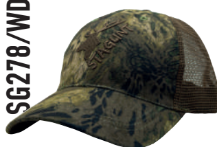
WILD CAP SG278/WDC