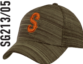
KNIT CAP SG213/055