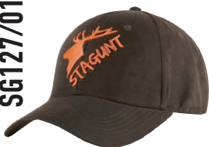
PEISEY CAP SG127/012