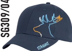
STAG CAP SG309/041