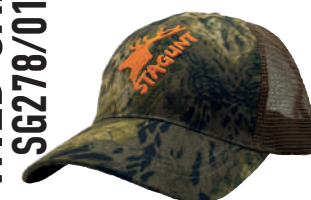
WILD CAP SG278/012