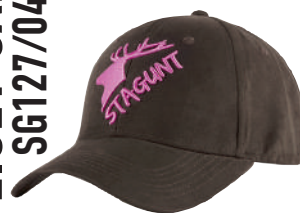
PEISEY CAP SG127/042