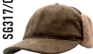
TIMBER CAP SG317/022