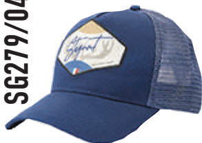
ANTLER CAP SG279/041