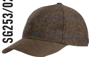
SP GAME CAP SG253/022