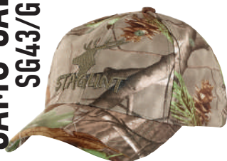
CAMO CAP SG43/GC