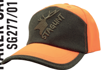
TRAKER CAP SG277/012