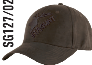
PEISEY CAP SG127/022